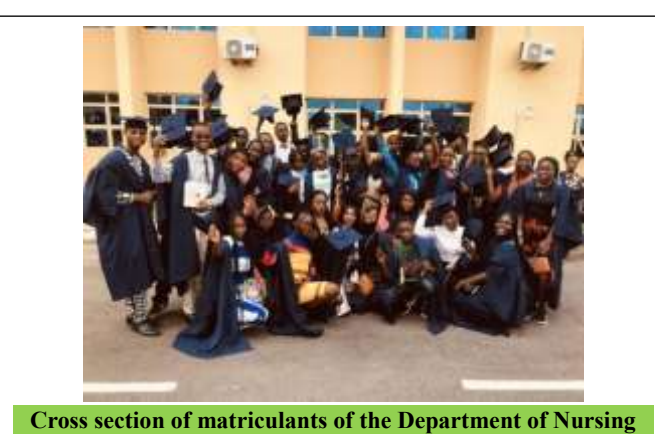
LIST OF MATRICULANTS IN THE DEPARTMENT OF

NURSING, FACULTY OF ALLIED HEALTH SCIENCES