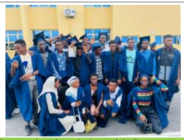
Cross section of matriculants of the Department of Information Technology and Health Informatics

Once again I congratulate all the matriculating students and wish you an industrious and fruitful stay in the serene environment of Ila Orangun. I pray that the Almighty God will protect all of you and make you all a source of pride to your families so that today's joy may be permanent.