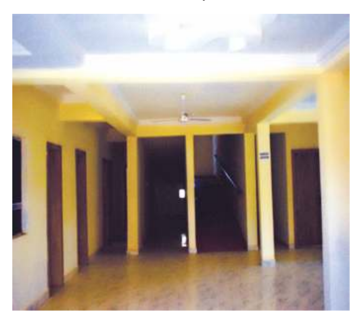
Inside view of the University Health Centre.