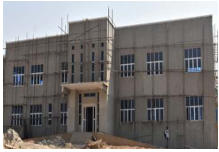
The front view of the University Library