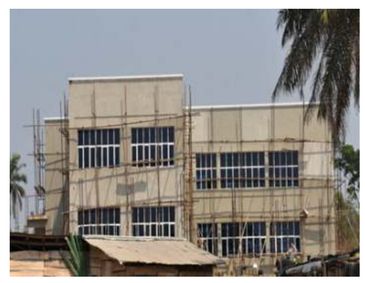
The back view of the University Library