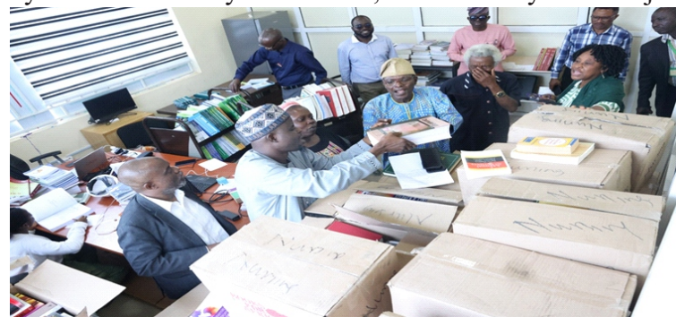
Members of the University Management inspecting the books at the University Library