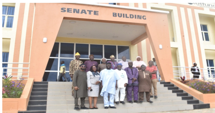
Members of the University Management with members of the TETFund Board of Trustees

The visit underscored TETFund's commitment to ensuring accountability and advancing tertiary education in Nigeria and FUHSI's dedication to delivering quality healthcare education.