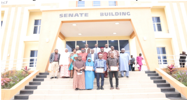
The Member of the University Management with the Awardees and the members of the Osun State Development Forum.